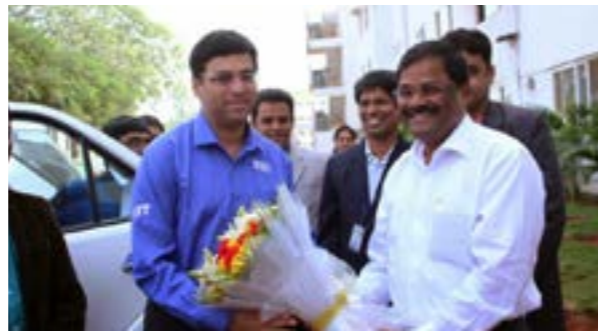
Viswanathan Anand Indian Chess Grandmaster