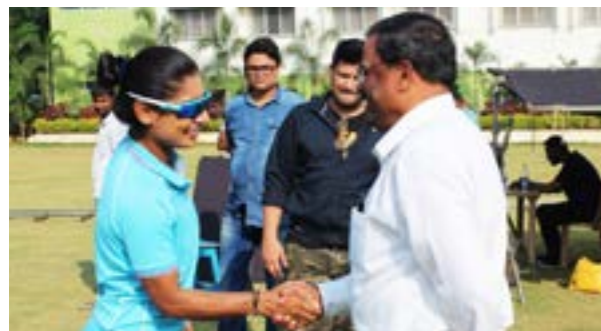
Ms. Mithali Raj Captain of Indian Women's cricket team