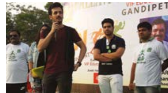
Mr. Akhil Akkineni Indian Actor