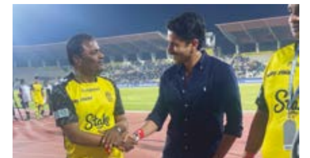
Mr. Naga Chaitanya Indian Actor