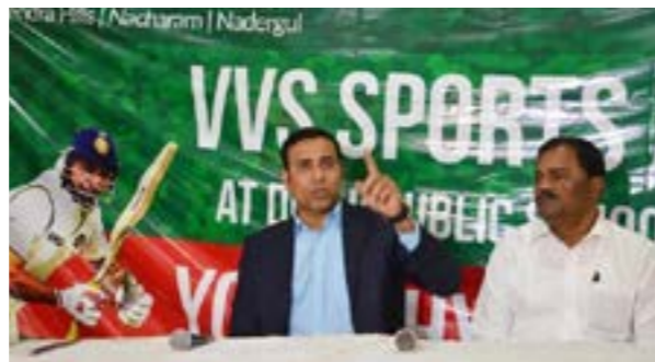
Shri V V S Laxman Former Indian Cricket Player