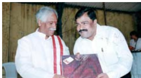
Shri Bandaru Dattatreya Minister of Labour & Employment