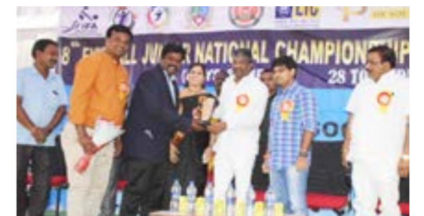
Shri T. Padma Rao Goud Sports & Exercise Minister