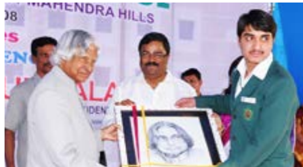
Shri A P J Abdul Kalam Ex - President of India