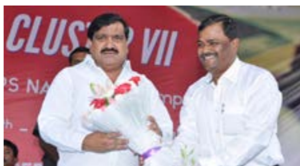
Shri P. Mahender Reddy Minister of Telangana Transport Department